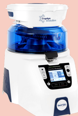
Precellys® Evolution + Cryolys® Evolution combo