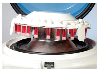
2mL accessories Up to 24 tubes of 2mL (or 0.5mL)

Fully adapted to any type of sample: 5 volumes of tubes and accessories