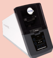
Minilys® for personal use