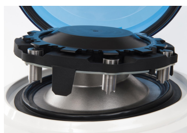
Metal tubes Up to 6 tubes (6mL accessories) Used for very hard samples