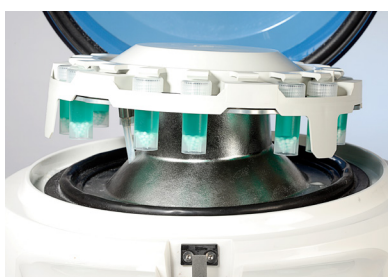
7mL accessories Up to 12 tubes of 7mL