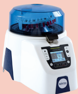
Precellys® Evolution Super Homogenizer