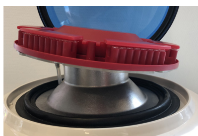
96 well-plate accessories From 8 to 96 wells of 0.3mL Prefilled 96 well-plates available