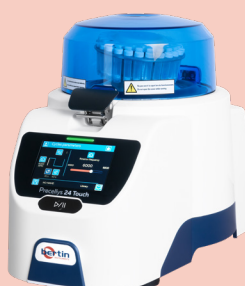
Precellys® 24 Touch Intuitive Tissue Homogenizer